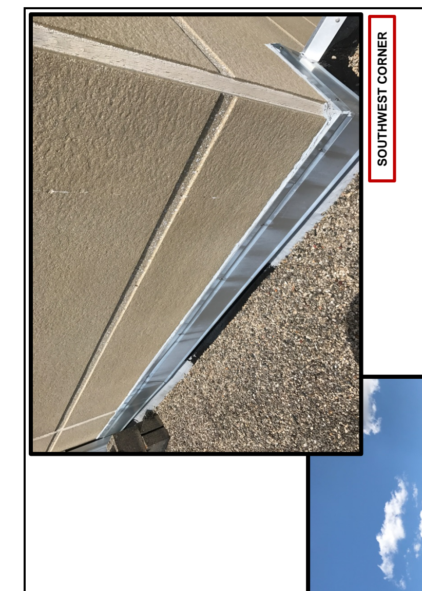
FIGURE 3 ROOFTOP PICTURES OF ELEVATOR / STAIR TOWER