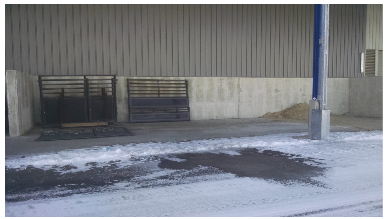
Figure 5. Pavilion #2 wash rack location

The above pictures have been provided for your convenience and should not be viewed as an alternative to the site tour on Tuesday, March 17. In addition the architectural and plumbing plans for the existing wash racks are provided with the enclosed bid documents.