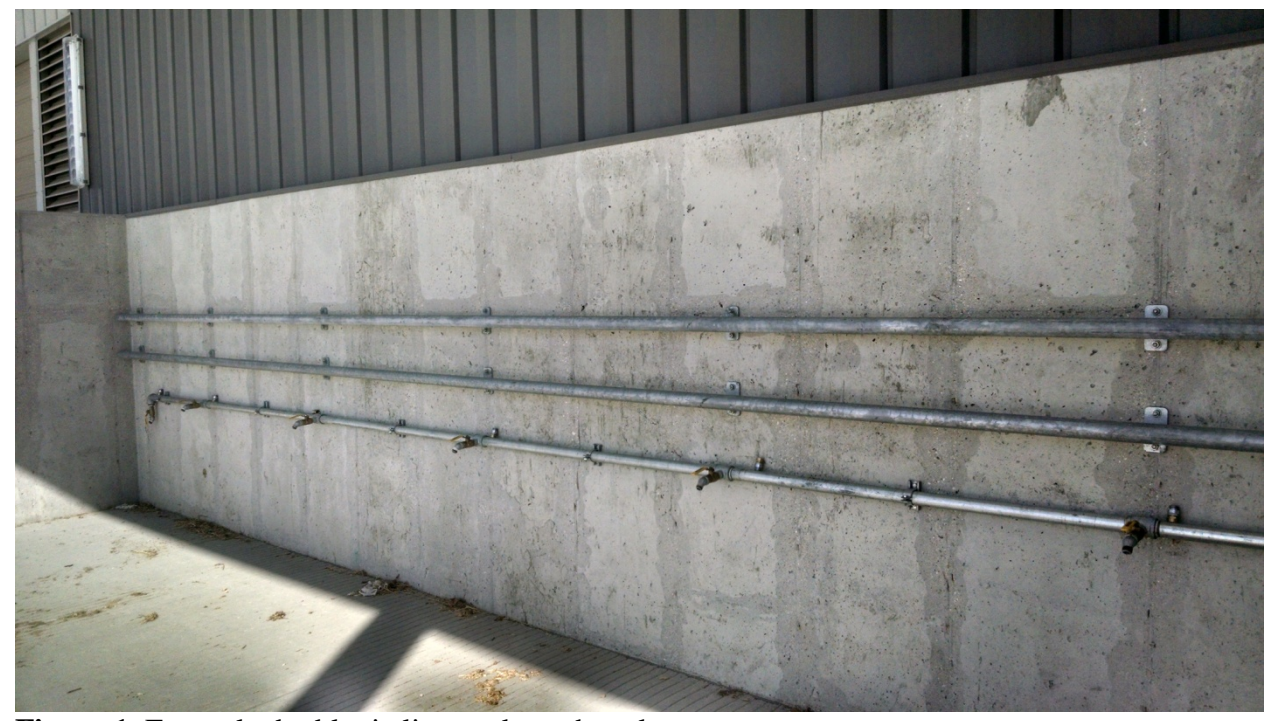
Figure 1. Example double tie livestock wash rack.

This project requires the successful bidder to be responsible for the complete design (all permitting through plan approval) and construction of the livestock wash racks and trench drains. A total of 150' of wash racks will be added to the Alliant Energy Center New Holland Pavilions. Pavilion #1 will have 90' of single tie wash racks on the western end of the building, south of the entrance doors. Pavilion #1's wash rack shall have 15 hose bibs and shall include one 7'9" tall and one 3'9" tall by 10' long fiberglass sheathed metal framed end walls. Both end walls shall be adequately supported. The wash racks for Pavilion #2 will extend 60' from column lines 10 to 12 (between two existing concrete walls), with two tie rails and 10 hose bibs. Both wash racks shall have trench drains running the entire length of the wash rack that drain into the sewer. The wash rack areas shall be a 10' wide concrete slab with a grooved float finish. The new wash racks to be installed will need to match in size and appearance of the existing. Architectural and plumbing drawings for a previous wash rack addition between columns 15 and 16 are included for bidders reference only.