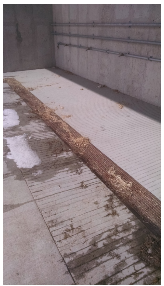
Figure 3. Typical trench drain and concrete finish.