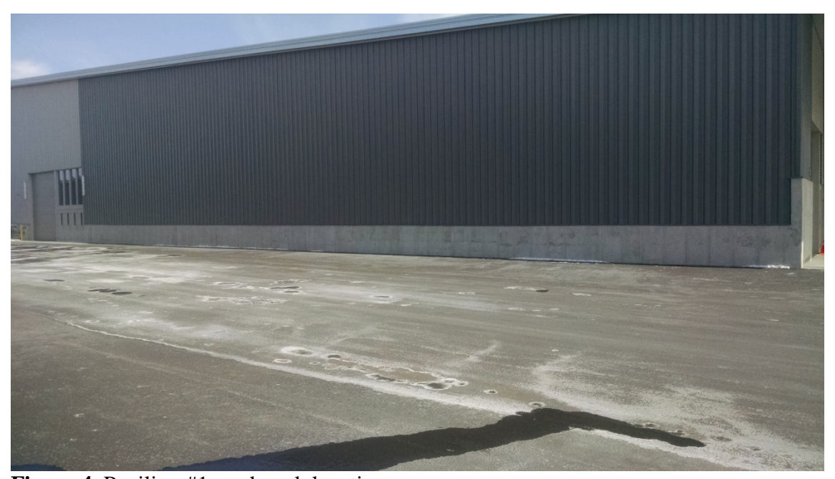
Figure 4. Pavilion #1 wash rack location.